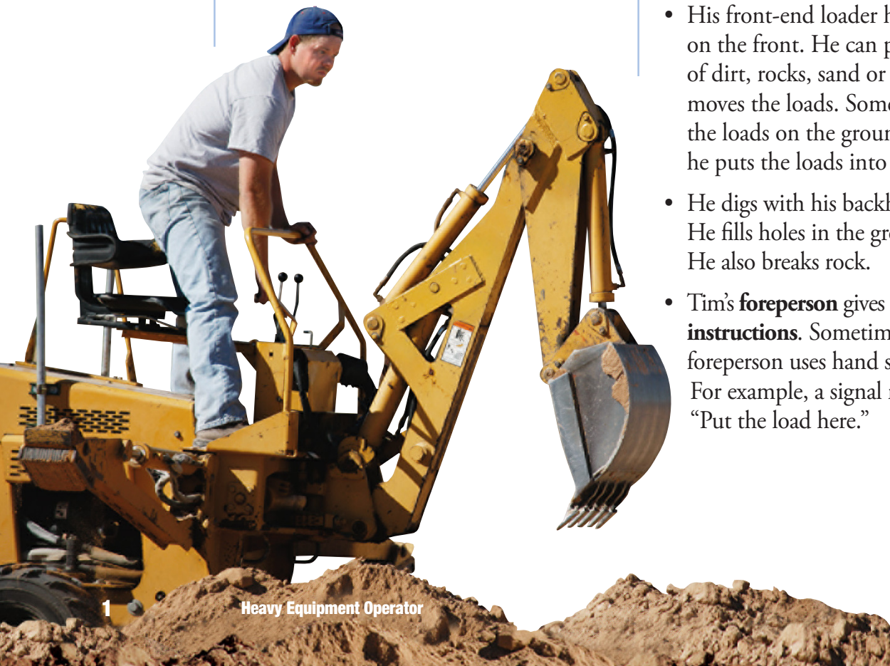
1 Heavy Equipment Operator